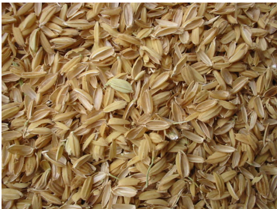
Rice husk used as a source of energy.

A renewable energy plant such as this reduces the need for fossil fuels. The project fulfils the criteria for becoming a CDM project (Clean Development Mechanism) and has been possible to establish thanks to the CDM validation and the following issuing of Certified Emission Reduction (CER) credits by the UN.